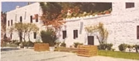
The Erteğün House restored by Cansever.

*Assistant Professor of History at Ibn Haldun University.