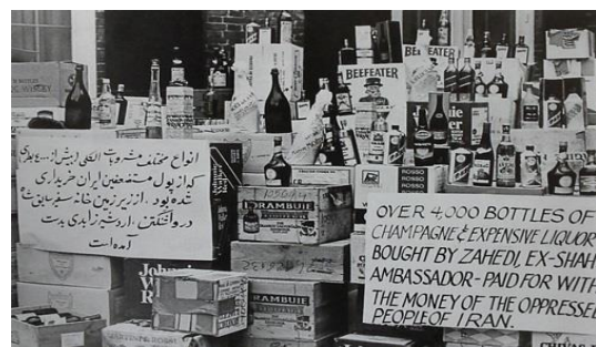
Picture 4. Collect alcoholic beverages from the city of Tehran and homes

With the start of the war between Iran and Iraq, the development plan of Tehran was also in trouble. In the last years of the war, Tehran witnessed a missile bombardment, which raised the need for reconstruction for this city more seriously than ever. The