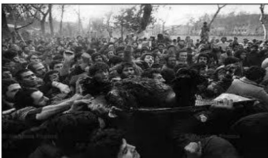
Picture 3. burning Shahr-e-; burned corpse of a prostitute on the hands of the revolutionaries