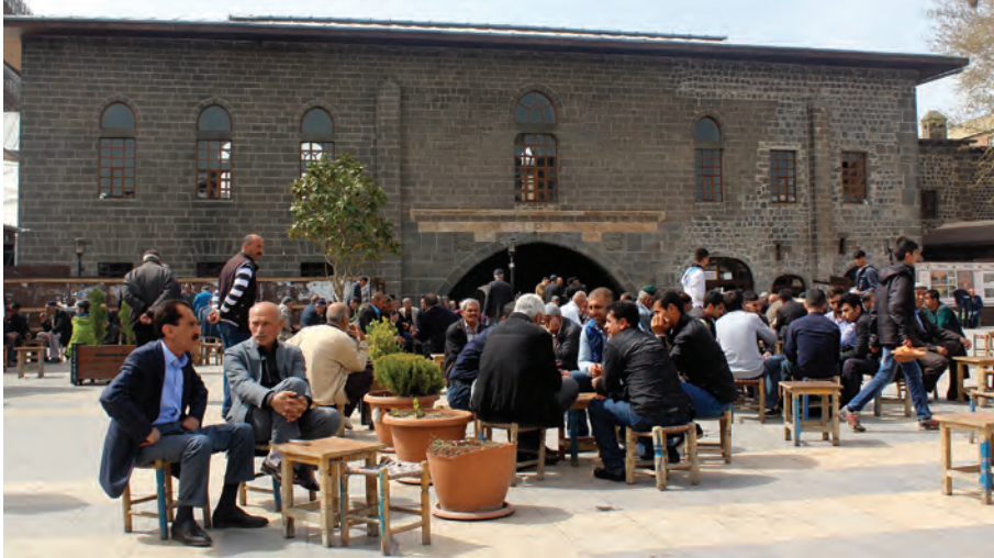
The people of Diyarbakır were once more free to sit in front of the Great Mosque after the curfew was lifted in March 2016.