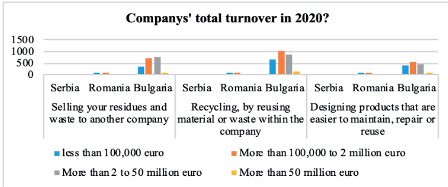
Figure 2: Companies' turnover in 2020